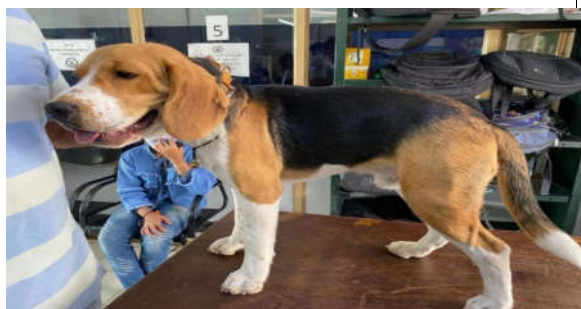
Fig. 5: APPEARANCE OF THE DOG ON DAY-84