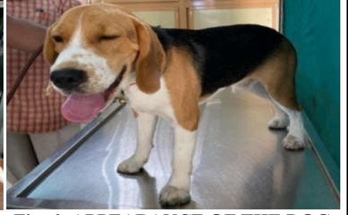
Fig. 6: APPEARANCE OF THE DOG ON DAY-120

Omega-3 and omega-6 fatty acid supplement @ 0.5 ml/ kg orally was given throughout treatment period. Other oral supplements included a herbal immunomodulant syrup, 3 ml bid for one month) and a dietary protein supplementation, 15 g daily. The case was reviewed on 28-, 56-, 84-, and 120-days post treatment (Fig.3, 4, 5 and 6). Fungal spores were negative on superficial skin scrapings on 28<sup>th</sup> day post