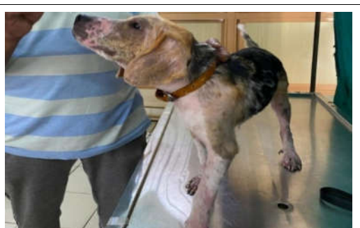
Fig. 3: APPEARANCE OF THE DOG ON DAY-28