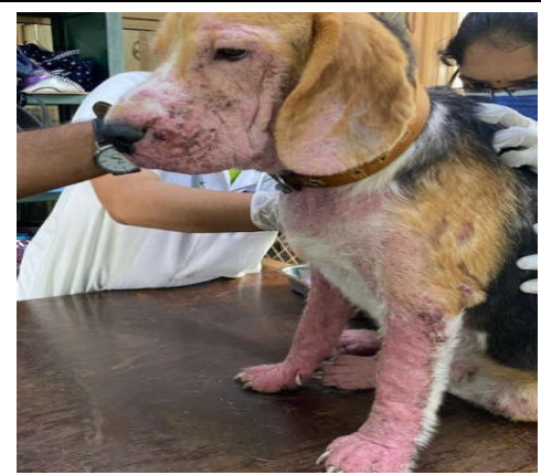
Fig. 2: APPEARANCE OF THE DOG ON DAY-1.